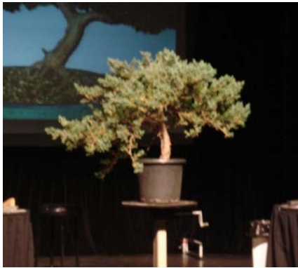
Juniper before any styling

If you want to thicken up your trees plant them in the ground or you can cut the bottom out of your pot and grow them this way. Remember to always keep the roots under control; this can be done by placing a sheet of timber just below the root making them grow outwards.