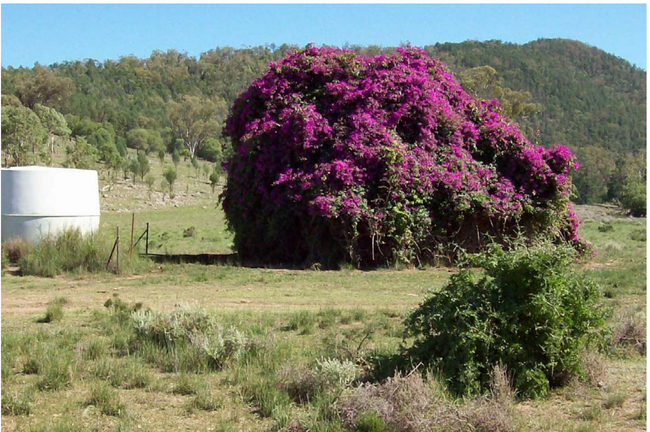
The mother 'Boug'

"It's just around the corner" was what I heard as in front of us came to view the biggest boug I had ever seen. "Bloody Hell"; I thought to myself, I have come a long way for nothing as this is far too big to dig out. Now I like big material but this was ridiculous, first impressions were "WOW" but on viewing the big 'Boug' a smaller one had grown on the outer edge and this is the tree we targeted.