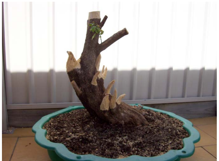
The 'Boug' after initial carving