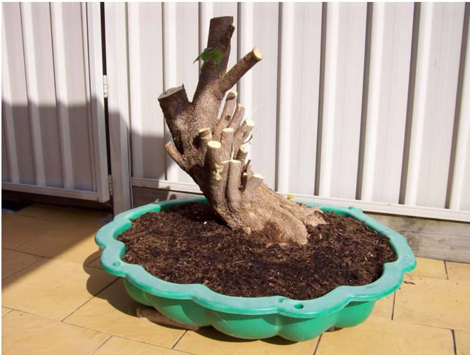
The 'Boug' after potting