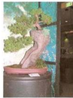
Campsis grandiflora -Trumpet Creeper