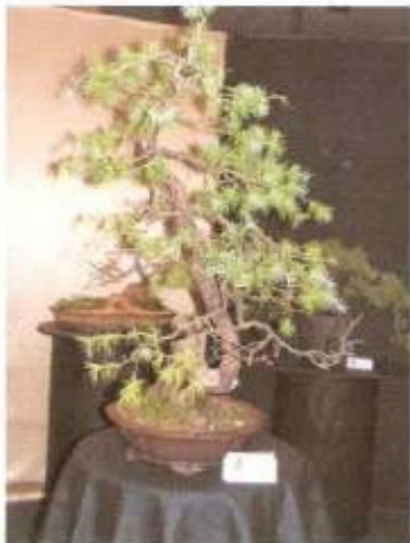
Cedrus Deodar -1950 Dorothy Koreshof