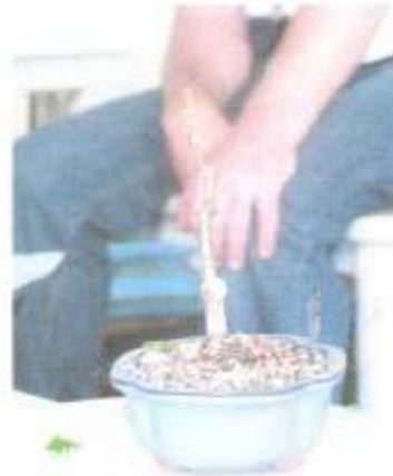
Roslyn's Maple - After