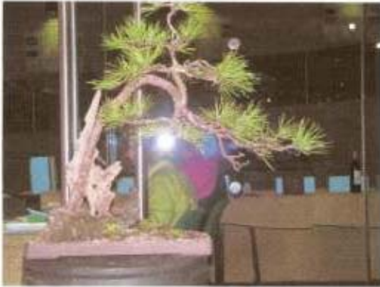
Black Pine with Driftwood -22yrs.