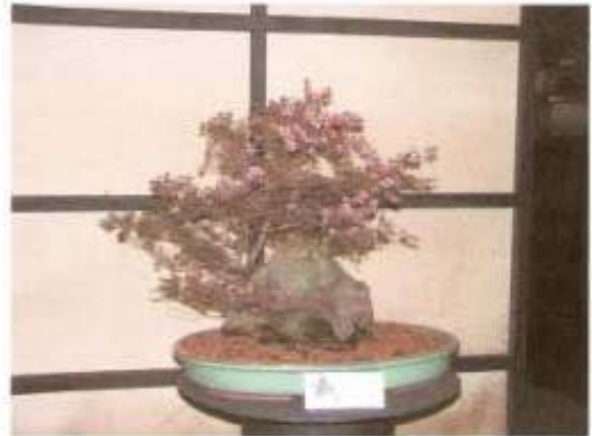
Tea Tree (that's how it was spelt) 2002 - Ian White.