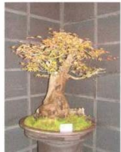
Japanese Maple -1928 Dorothy Koreshof