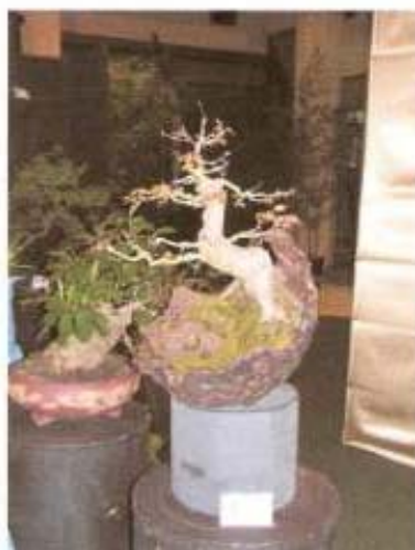
Japanese Maple -1945 Dorothy Koreshof