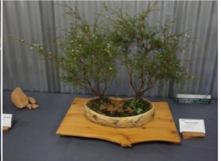
Baeckia Linifolia (Weeping Baeckia)