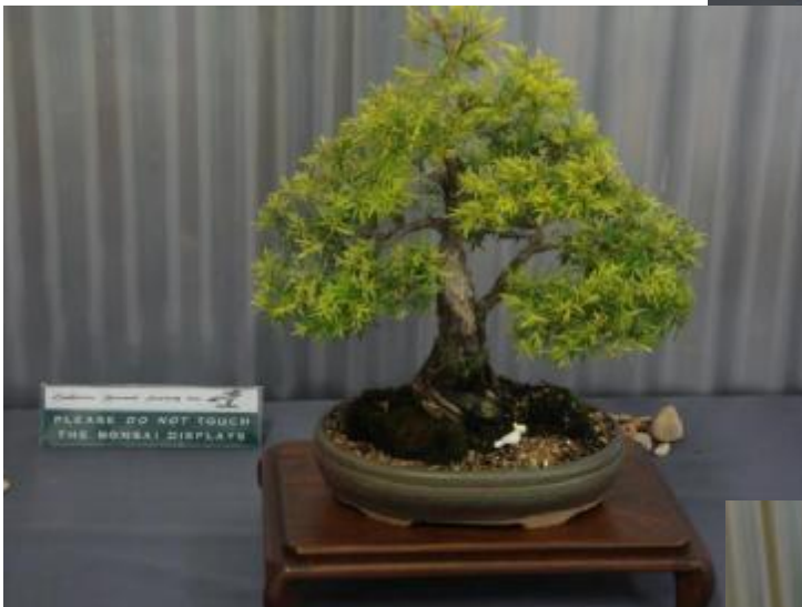
Leptospermum Laevigatum (Coastal Tea Tree)