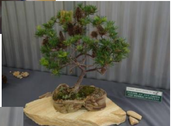
Melaleuca Bracteata (Revolution Gold)