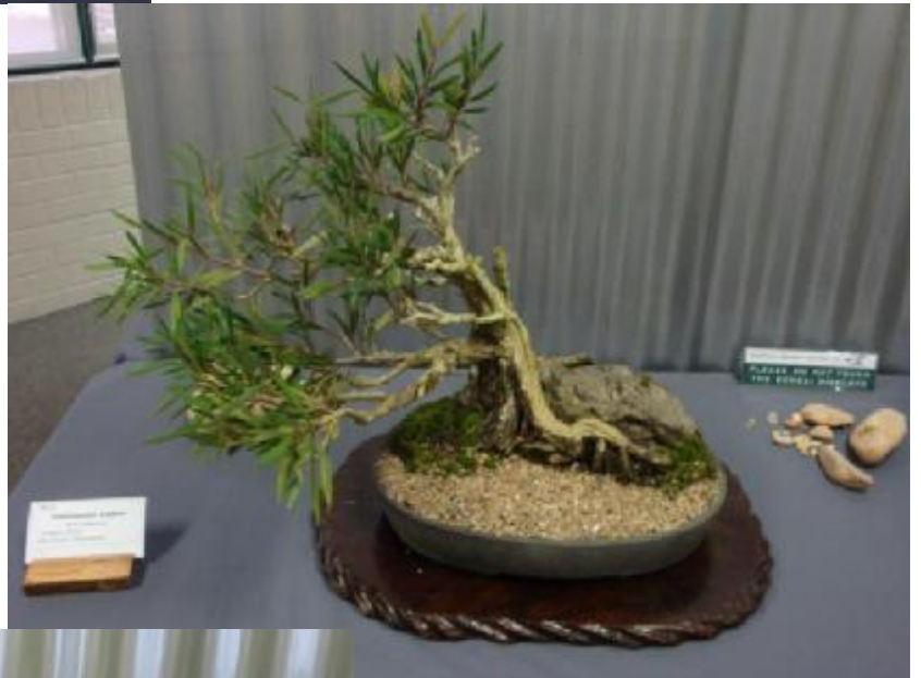
Melaleuca Alternifolia (Narrow Leaf Tea Tree)