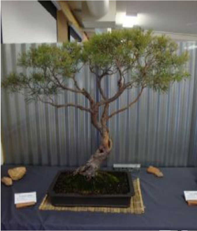
Callistemon Sieberi (River Bottlebrush)