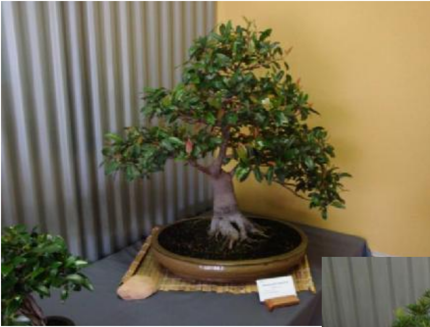
Elaeocarpus Reticulata (Blueberry Ash)