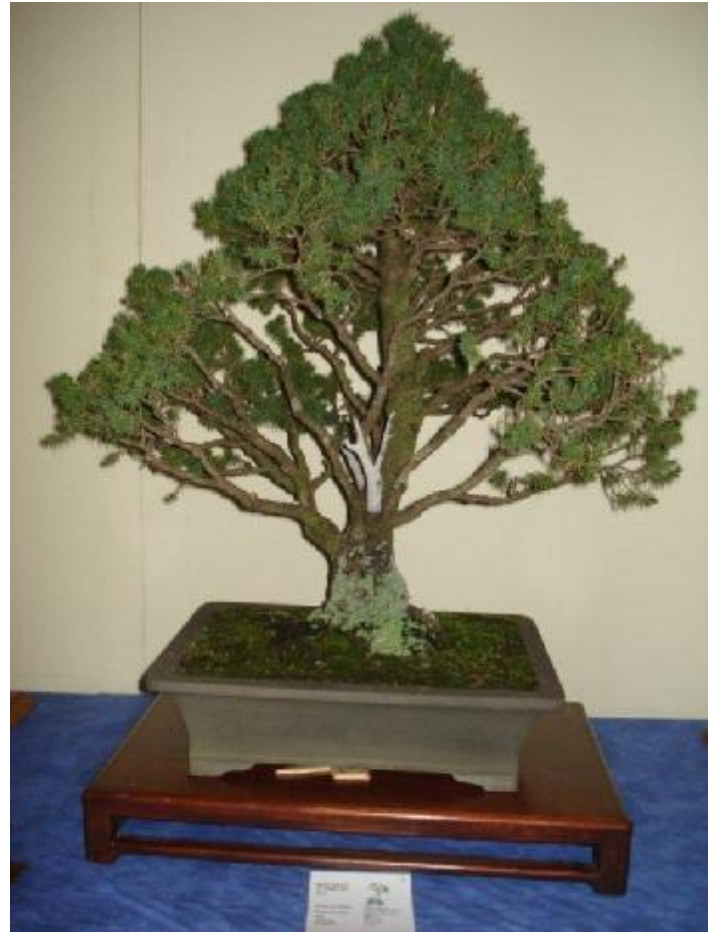
Above, Cedrus albertiana Left, Pyracantha Below, one of the show tables