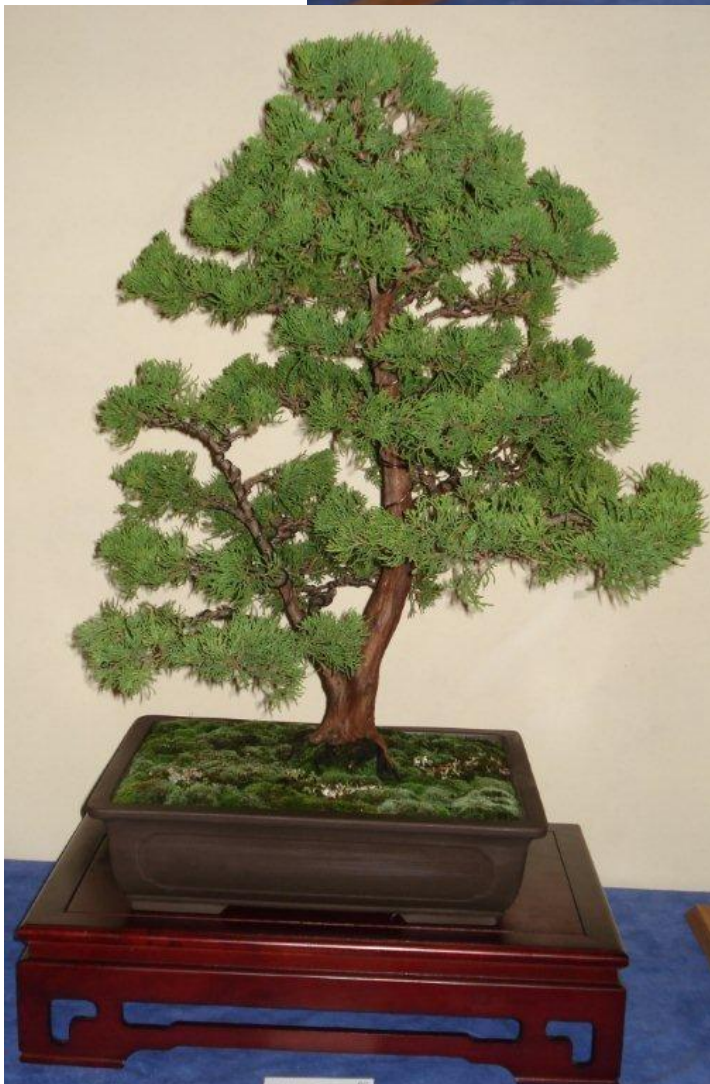
Above, Himalayan Cedar Left, Shimpaku Juniper Below, Juniper